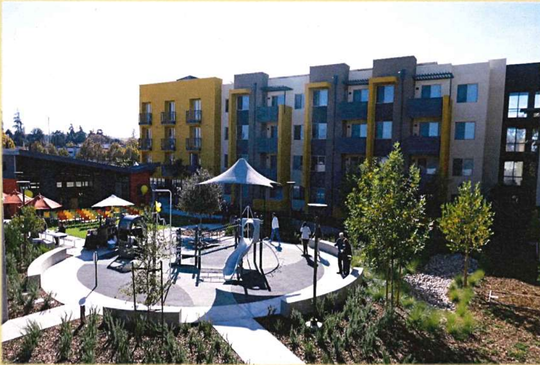
The Met North