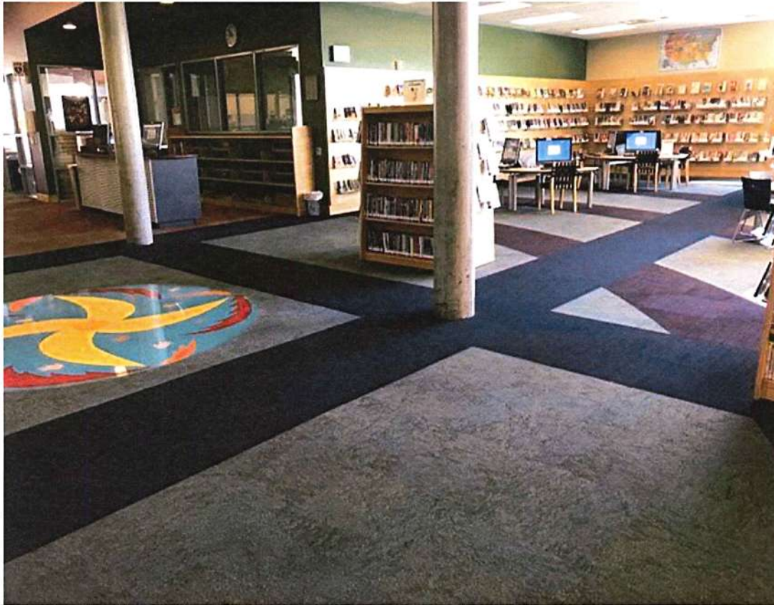
New Flooring and Teen Center Space at Libraries