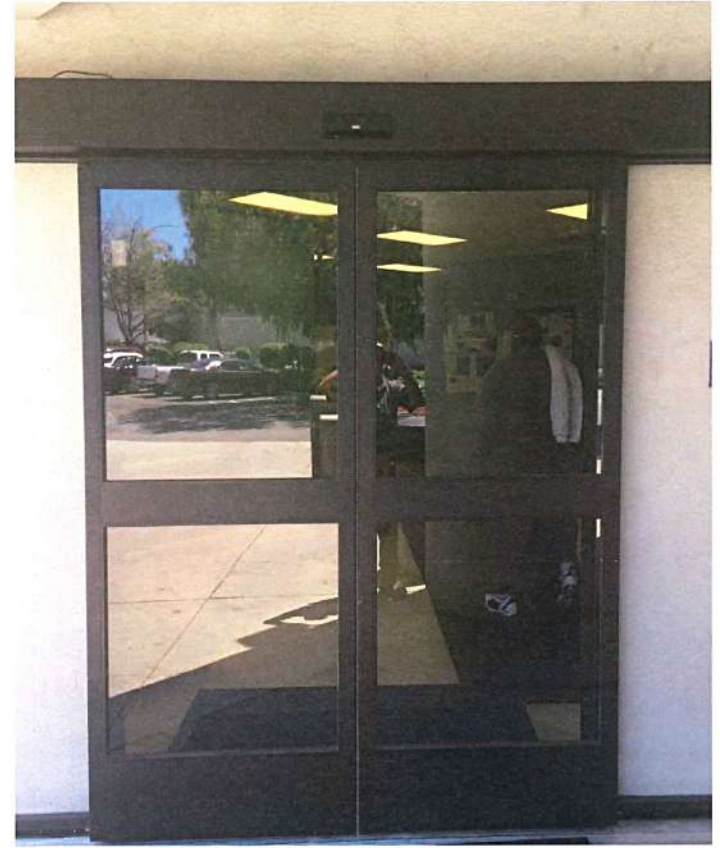
ADA Door and Kitchen Improvements at BRC