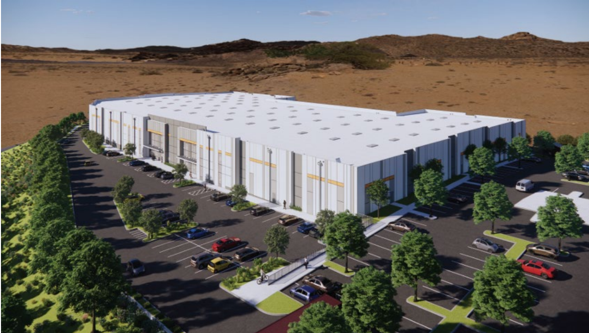
Figure 3. Project Rendering

Proposal: Site Development Permit (File No. H22-022)