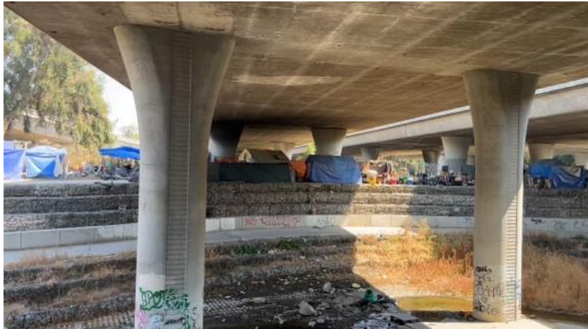
Pic. 2: After relocation of unsheltered residents and encampment closure