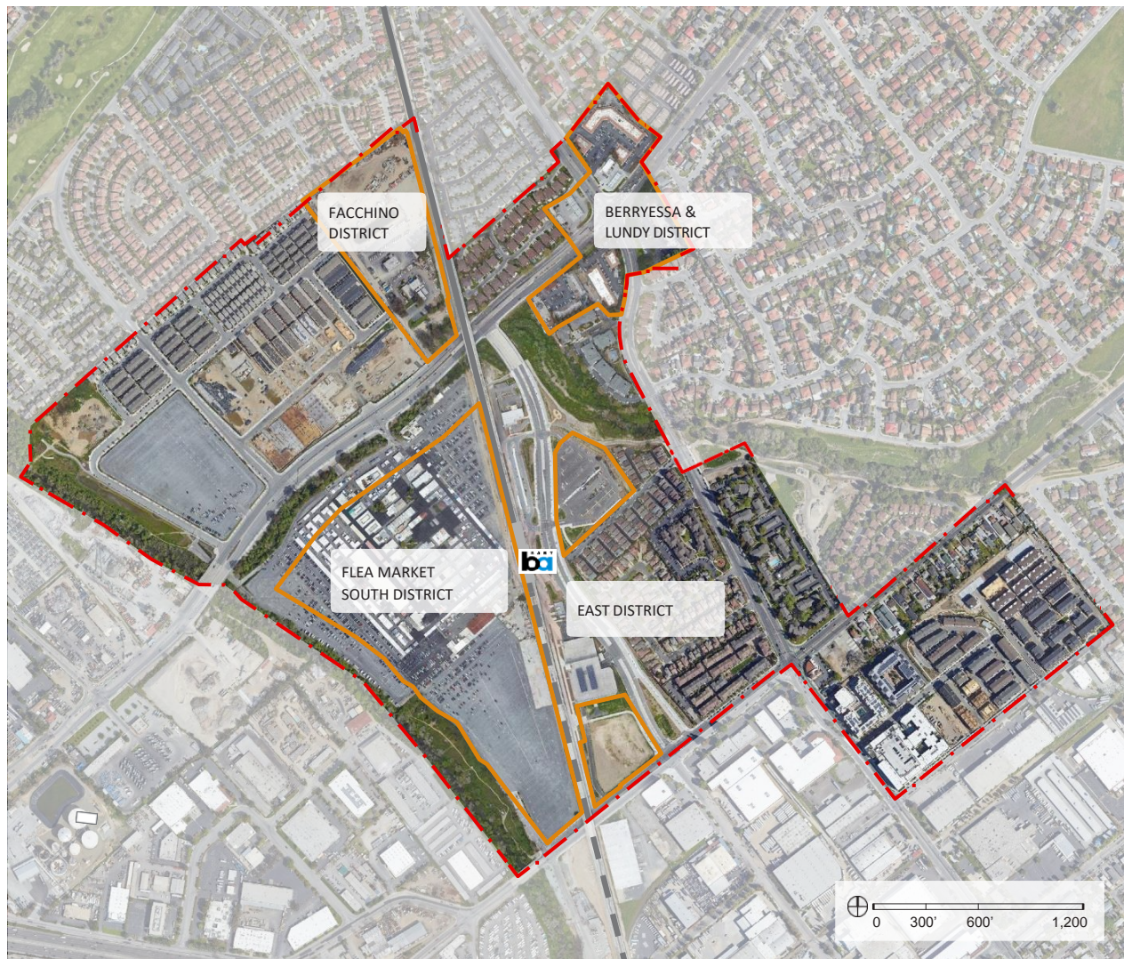
Figure 3-1: Districts