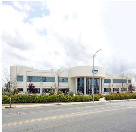
750 Ridder Park – 182k SF