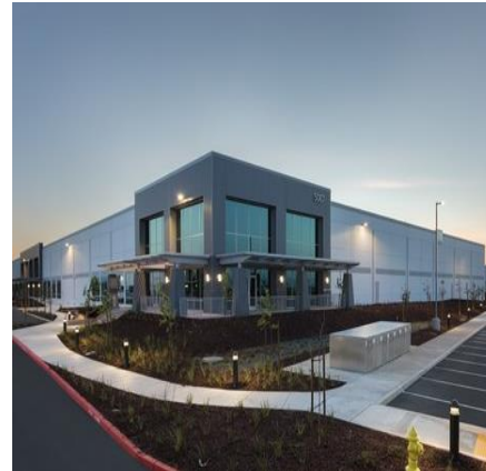
5087 Disk Dr – 162k SF