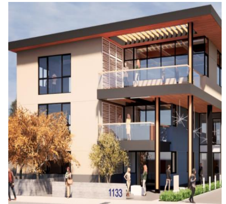
1133 Minnesota Ave – 16k SF