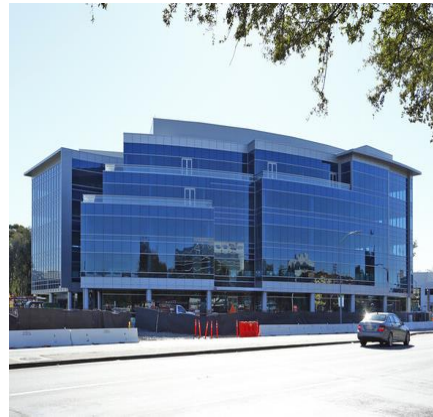
60 E Brokaw Rd – 117k SF