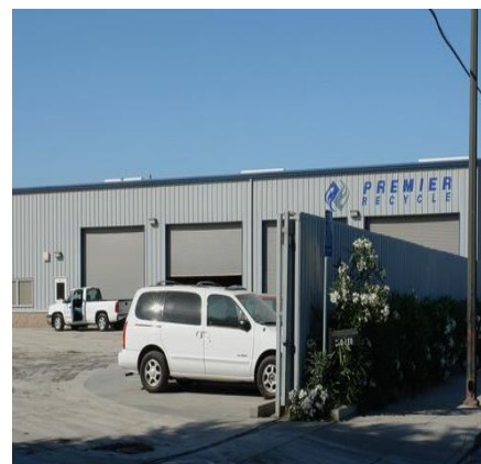
260 Leo Ave – 27k SF