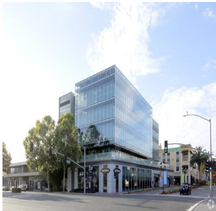
300 Santana Row – 79k SF