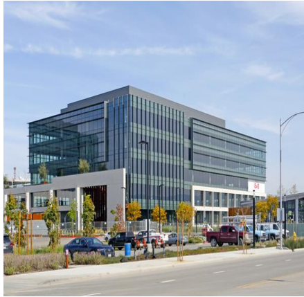
1143 Coleman Ave – 163k SF