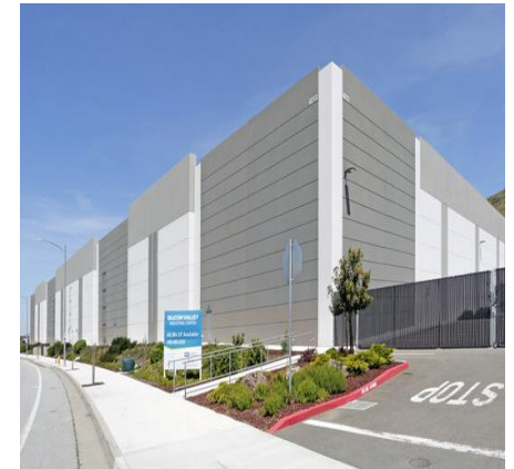
6212 Hellyer Ave – 150k SF