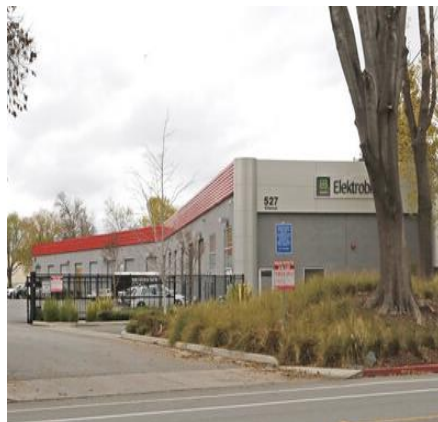
527 Charcot Ave – 32k SF