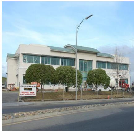
2077 Gold St – 24k SF