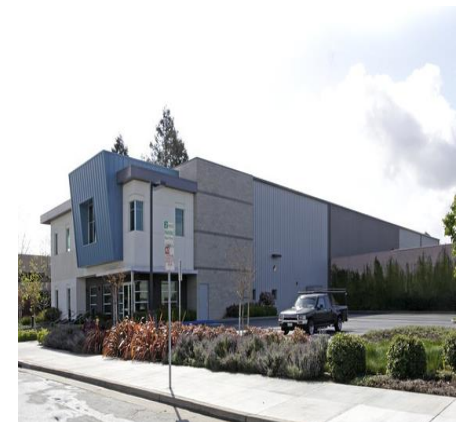
236 McEvoy St – 20k SF